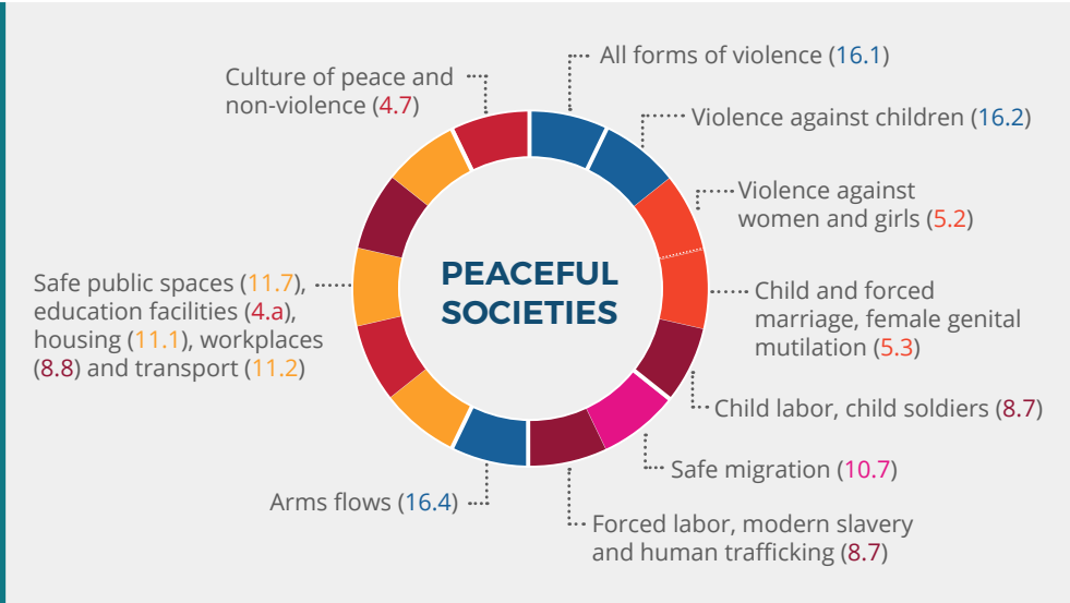
SDG16.1 and Related SDG Targets

SDG16 is widely recognized as critical to the achievement of all other SDGs, yet it lags behind most other global goals in terms of momentum, investment, and support worldwide. The Peace in Our Cities campaign has the potential to become a preeminent organizing initiative in support of addressing one of the most pressing challenges of our time, namely the concentrations of violence that threaten individual lives and undermine the growth and prosperity of our increasingly urban world. We hope you will join us.